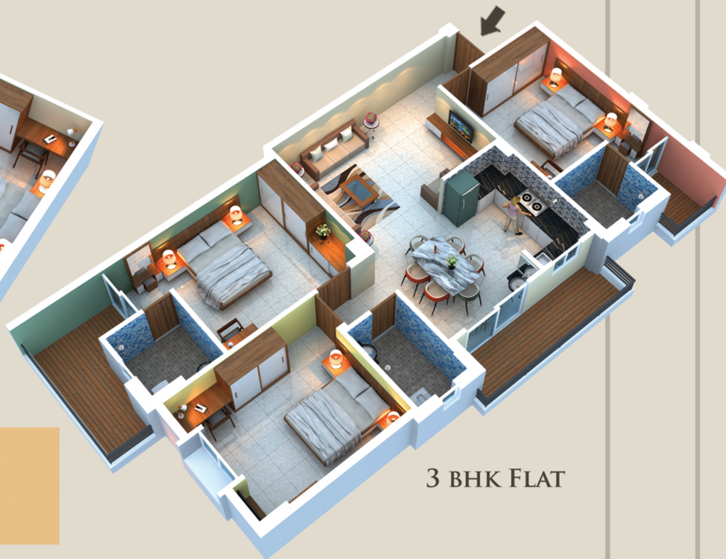
3 BHK FLAT